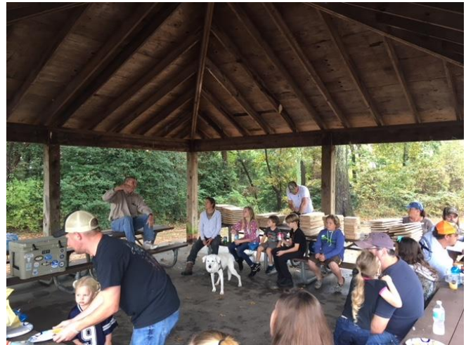
Community members participate in Virginia Conservation Network's youth hunter/conservationist event (see Public Lands section)