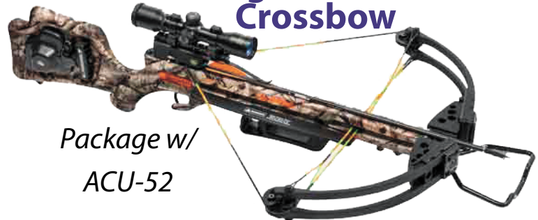
Package w/ ACU-52

Drawing to be held at Doherty's Tavern on October 9, 2017