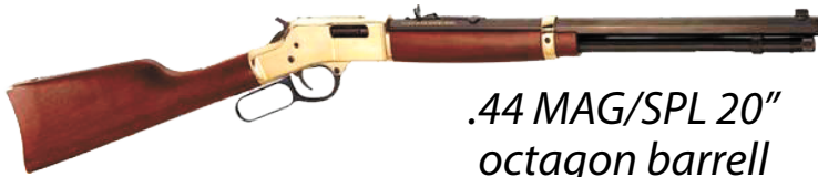
.44 MAG/S&W 20" octagon barrell