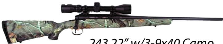
.243 22" w/3-9x40 Camo